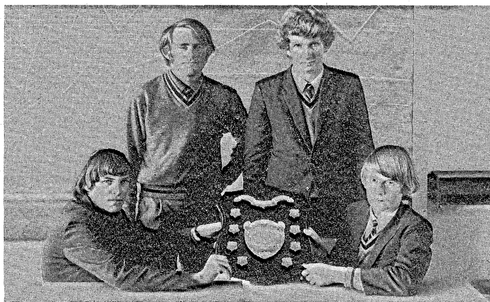
The Business Magnates with their Winning Shield.

Next morning we went by bus to Bulong (east of Kalgoorlie) and explored the abandoned gold shafts all around the area.